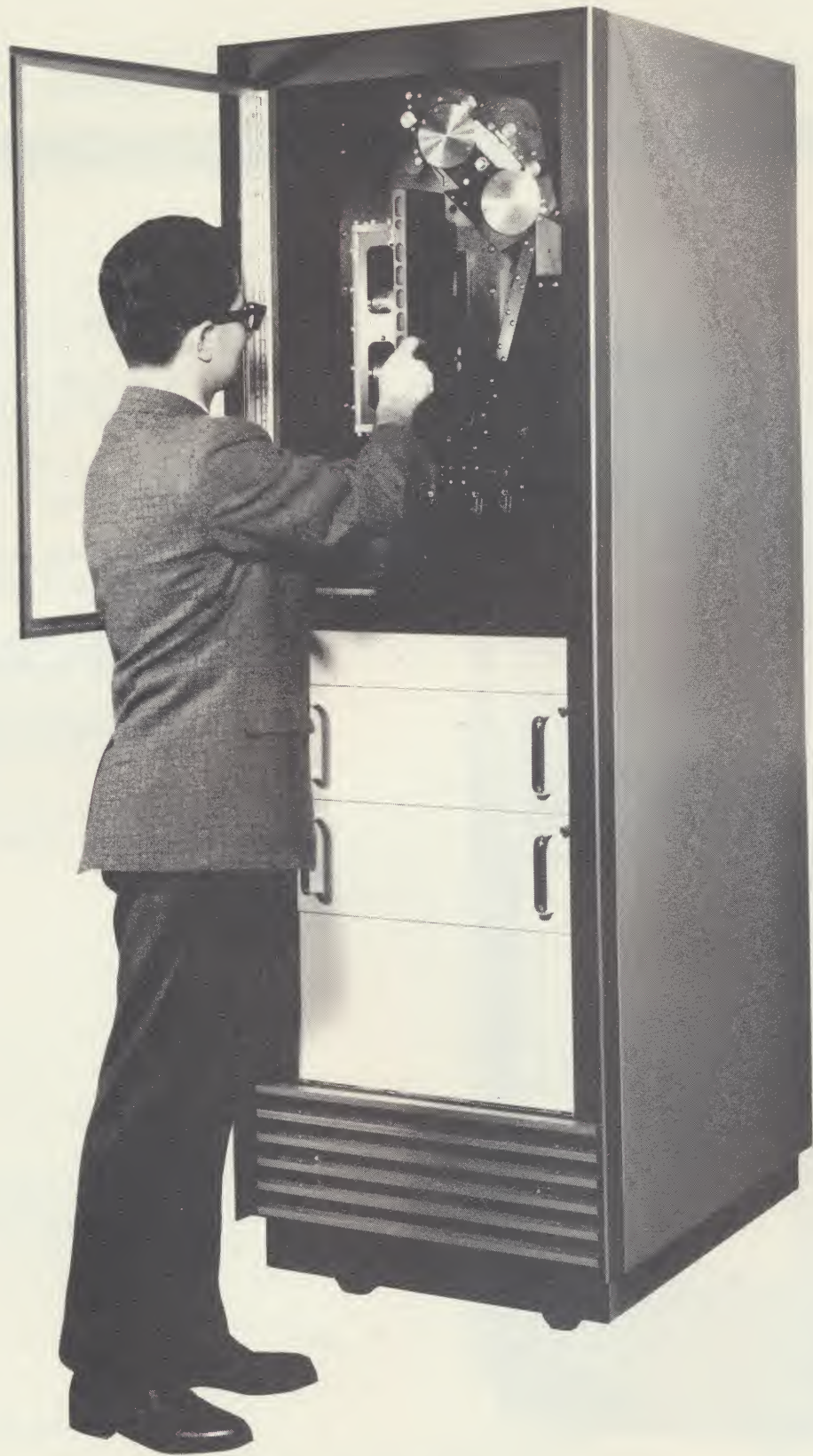
MODEL MCM-1 MAGNETIC CARD MEMORY